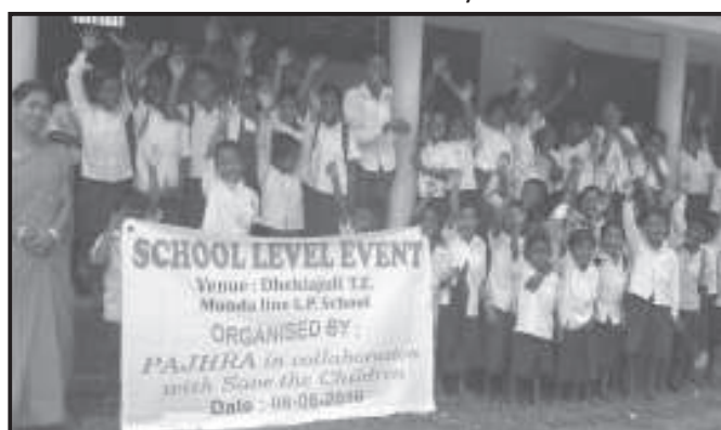
Children participating in School Level Event.

School level event was conducted at Dhekiajuli Tea Estate in Munda line School, on 8 th June. Different events were organized for the student to develop their inborn skills and capabilities. Programs like quiz, singing, dancing, and drawing competition were held among the student of same age groups to build their confidence level and to see their ability.