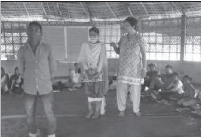
Role play enacted during Awareness Programme on WASH.