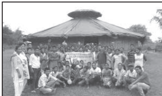
The participants of Awareness Programme at Sapoi Bhutia Ali (ACRTC), Dhekiajuli.

Body presentation and Society's rules and regulation on Male and female Dress, to have a clear knowledge on it.