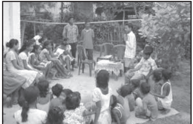
Children discussing the issues and problems related to them.

of Dhekiajuli, Dherai, Dibrudarrang, Narayanpur and Thinkhuria tea estate in the month of April, May June. They interacted with the Teachers and Students of the school regarding the problems and challenges faced by them. They also attended the Children group and Child protection committee meetings to discuss the important issues related to child marriage, child labor and child trafficking.