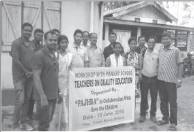
Teachers training on Quality Education.