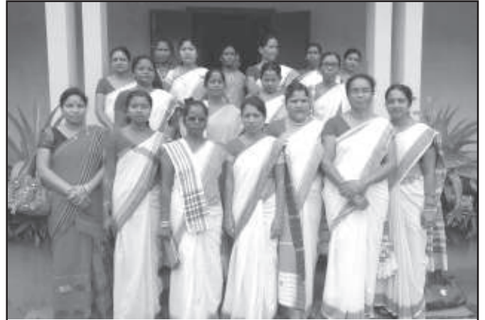
Members of New Women Forum Committee.