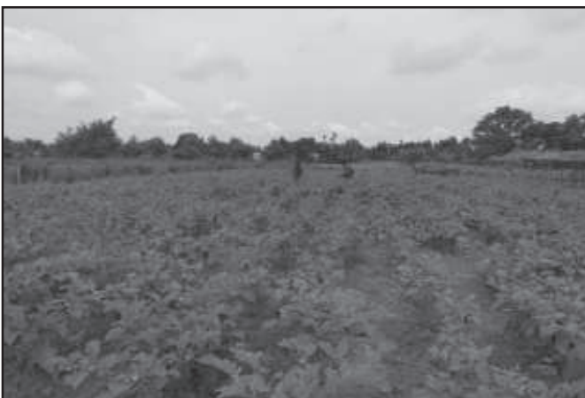
The Cultivation in ARCTC.