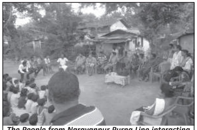
The People from Narayanpur Purna Line interacting with the delegates from Delhi & Kolkata.