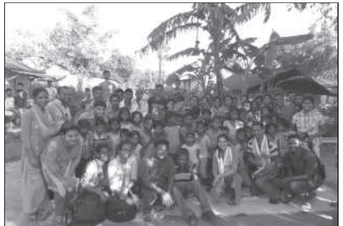
Deligates from Delhi (STC) visited Tinkhuria T.E. along with PAJHRA & PAD Staff.